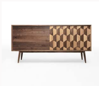
SCARPA W SIDBOARD