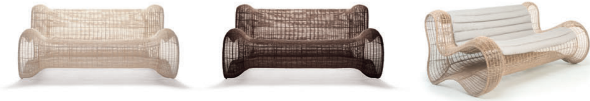
with optional seat cushion